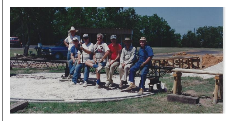
April 8, 1995- Construction of the turntable begins.

October 10,1994 torrential rains hit the Waller County prairie sending flood water down Little Cypress Creek wreaking havoc with the track laying on Phase I, wiping out about 75% of the track.