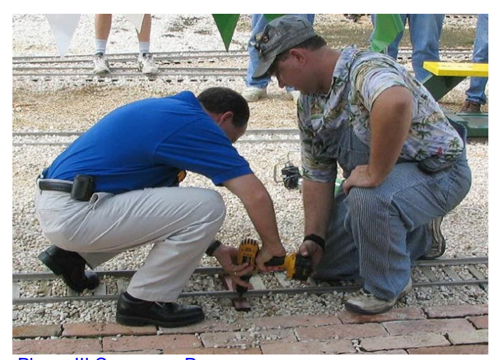
Phase III Ceremony Page

2002 began with the redesign of the departure and arrival tracks at Cypress Creek Station to facilitate better passenger flow on run days. These changes proved very successful as HALS surpassed 2000 free rides several times during the year. Construction began on phase III with major advances being made in establishing the roadbed through the swampy section between the Cedar Bend Bridge and the South Swale Bridge. Track work was completed from Sumrall to Caliente and the foundation was laid for the South Swale Bridge.