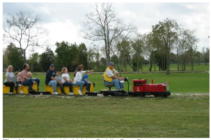
The November 15, 2001 - Public Run Day set a new milestone with 2003 free rides given in a single day.

track. Zube Park also received a major contribution from the county in the form of landscaping around the gazebo and in front of the passenger station. In addition, many large trees have been planted to provide shade at several of the passing sidings located along the main line.